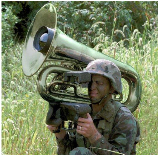
Meanwhile, the tubas left the whole mess alone to go work on experimental army tactics involving tubas, rockets, goats, and George Clooney.